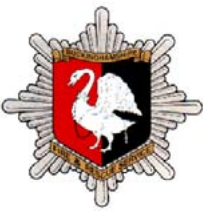
Buckinghamshire Fire & Rescue Service